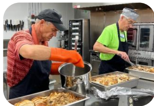
Kitchen-to-Table Food Recovery